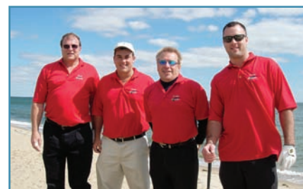
Cape Abilities Golf Tournament is held at New Seabury Country Club in Mashpee.

We accept Visa, Mastercard and American Express.